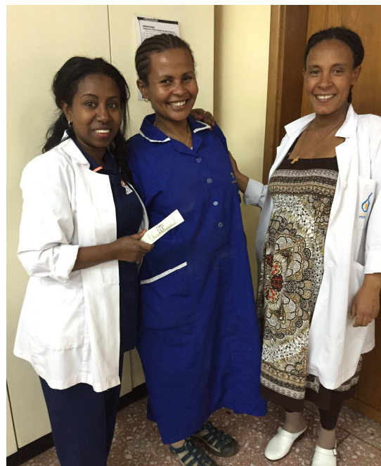
Hospital Staff at Hamlin Hospital

The Hamlin Fistula Hospital is a wonderful oasis of medical care. It is set among trees and flowers, the staff are dedicated to holistic care. Dr Catherine Hamlin is now 93 years old (her husband died over 20 years ago) and she lives on site. She is known as 'the mother of all mothers' and has created a unique centre of excellent medical care, combined with a loving and caring environment. I would highly recommend that MWIA supports the whole concept in any way that we can.