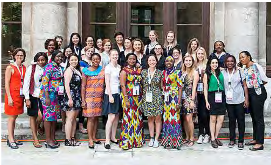
Members of yMWIA