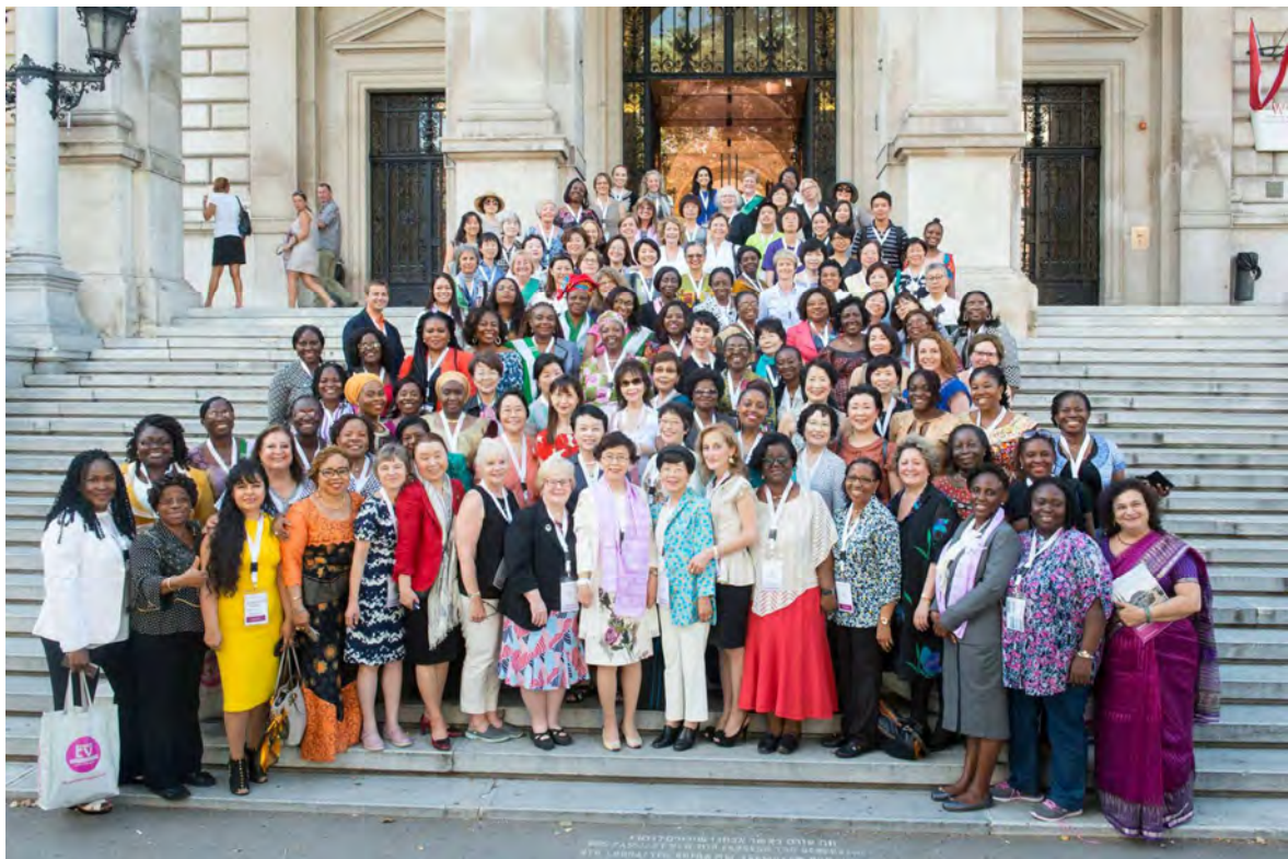
Many attendees at Vienna2016 gather on the steps of the University of Vienna having made many new friends and rekindled old acquaintances!

The XXXI Congress of the Medical Women's International Association will be organized by the American Medical Women's Association and will be held in New York City, the birthplace of MWIA in 1919.