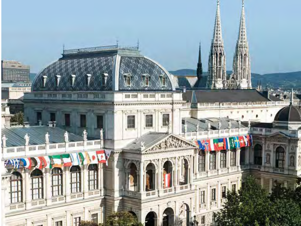
University of Vienna, as lifted from the program