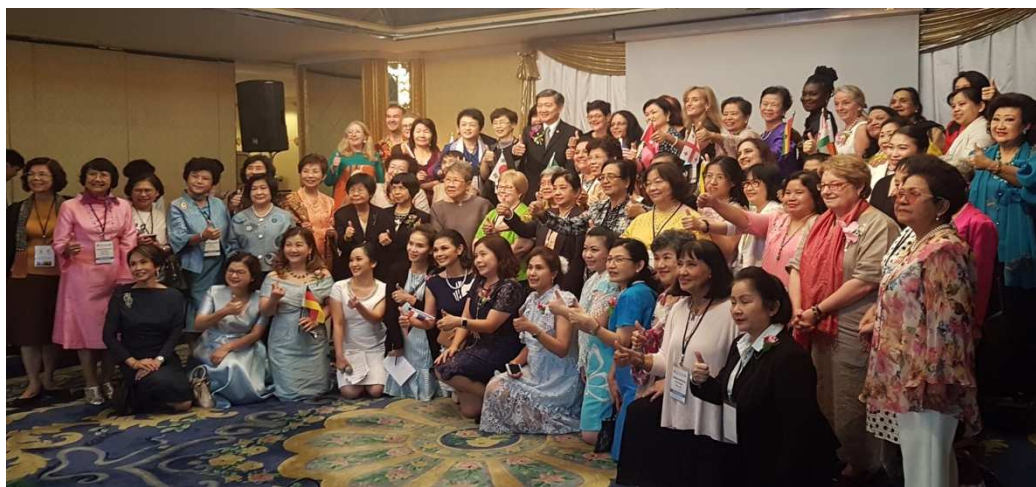
Relaxation time at Gala Dinner "Thai Night "

Although mainly in the Thai language, this link gives a flavour of the Central Asia Regional Congress https://www.youtube.com/watch?v=Ittj8JhyB4g