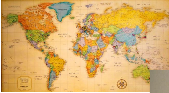
Map showing countries participating in the Centennial

MWIA Centennial Quilt with contributions from national associations