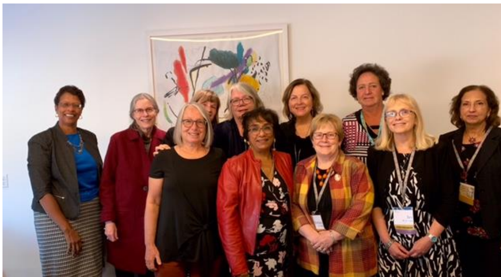
Pho of past residents of FMWC at the 2019 AGM