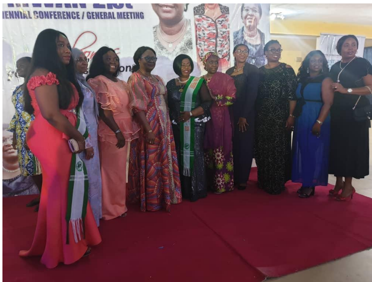
Photo of 2017-2019 Exco