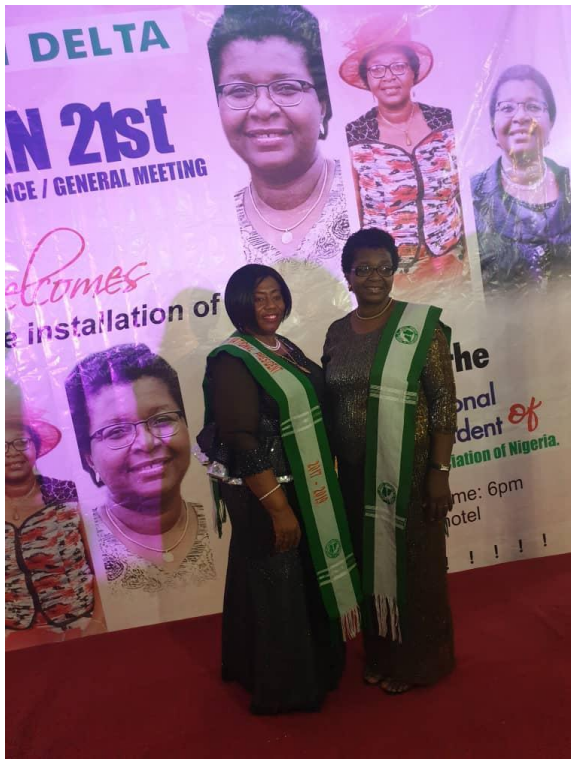
Past and current MWANPresidents