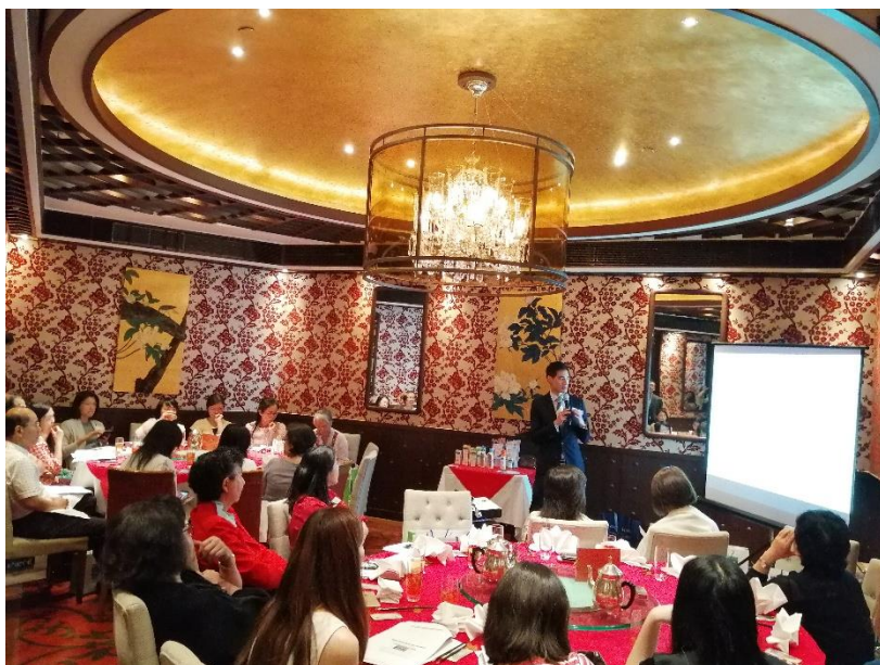
(3) A free health check for ethnic minorities