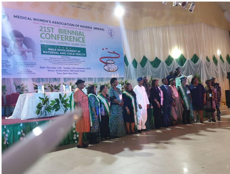
Dignitaries with health minister in white