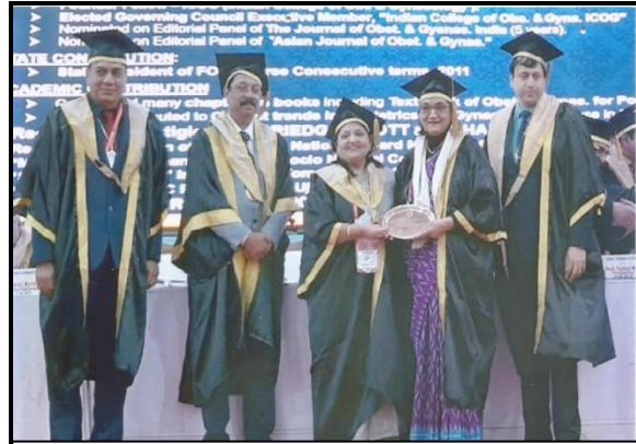
Founder Member Award at Convocation