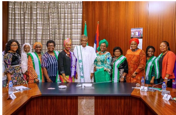
Presidents, Minister and MWAN members

In his twitter handle President Buhari said the following: