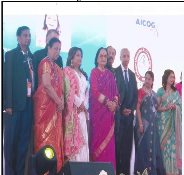
FOGSI Lifetime Achievement Award