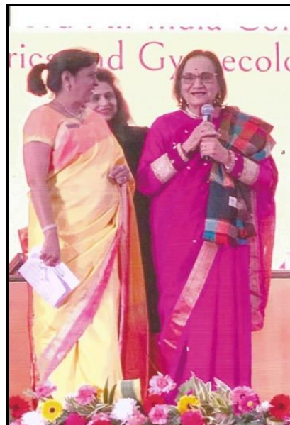
Acceptance speech after the Award