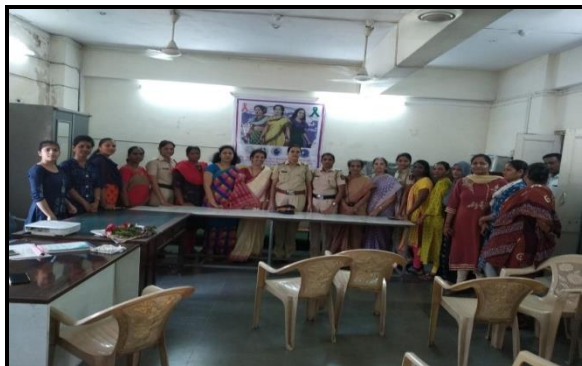
Vikroli Mumbai Police Camp