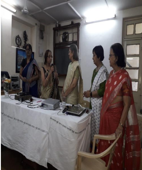
Out going President giving a donation of Rs 50,000 to AMWI