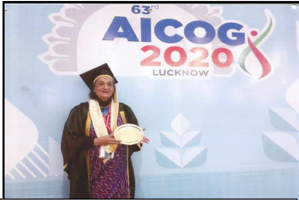
ICOG Founder Member Award