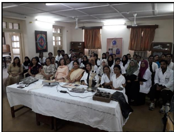
Training of Technicians at Camp