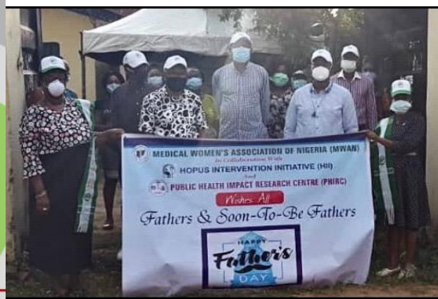
Above is a copy of the flier distributed and a picture with male participants and female observers after the round table discussion held on 23 rd June 2020.