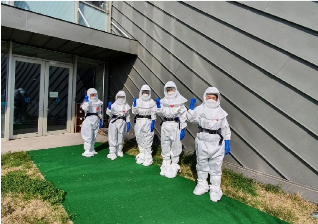
Fig.4 Medical personnel fully dressed in protective clothing outside and moving inside to treat patients.