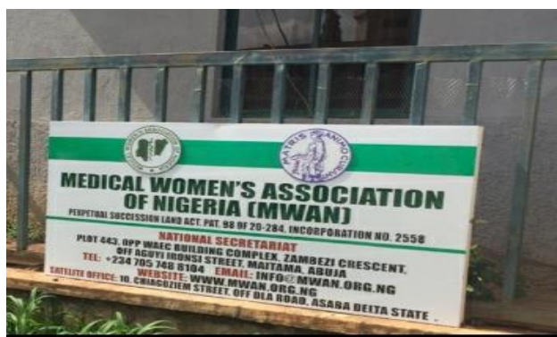
This is the association's billboard recently erected at the Secretariat in Abuja, Nigeria.